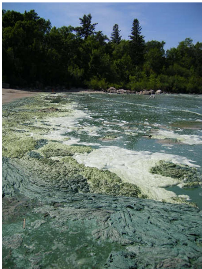
Fig. 1. Photograph of Grand Beach on the southern basin of Lake Winnipeg, August 2006.

to 5.5:1 by weight, well below the Redfield ratio. Large algal blooms were again in proportion to P additions, but the responding species were primarily N-fixing cyanobacteria (2, 7). To test further the hypothesis that low N:P favored N-fixing species, the ratio of N to P in fertilizer added to Lake 227 was decreased to 4:1 beginning in 1975. The hypothesis was supported, and N fixation was high in subsequent years (2, 15, 16). Lake 227 continued to be fertilized at this N:P ratio through 1989. By that time there were signs that the lake was becoming both C- and N-sufficient because of slowly increasing concentrations of these elements as the result of several years of atmospheric invasion and net fixation and retention of N_2 and CO_2 (15). As nutrient balance was approached, the domination of phytoplankton by N-fixing cyanobacteria was decreasing (16), and short-term N limitation was less pronounced (9). From 1990 onward, no N fertilizer has been added to the lake. P continues to be added, and P inputs have remained relatively constant throughout the 37 years of fertilization (Table 1).